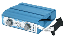
Cunha e Kit de Cunhas Roxtec